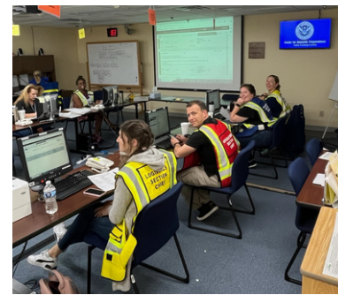
Center for Domestic Preparedness