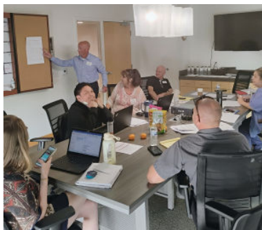
Friendship Village of Tempe