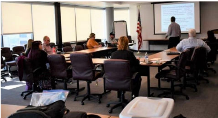
Homeland Security Exercise Evaluation Program training at AzHHA

This year AzCHER also held training sessions in crisis standards of care, chemical surge planning and medical moulage.