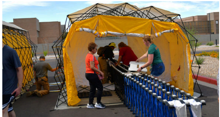
Valleywise Health and Honor Health training in decontamination procedures during a mass casualty drill.